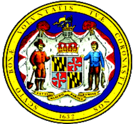
Larry Hogan Governor