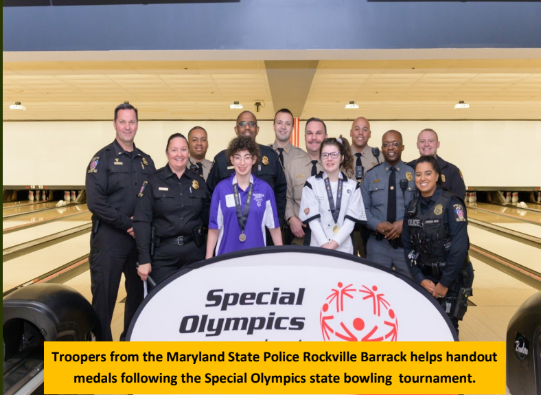
Troopers from the Maryland State Police Rockville Barrack helps handout medals following the Special Olympics state bowling tournament.