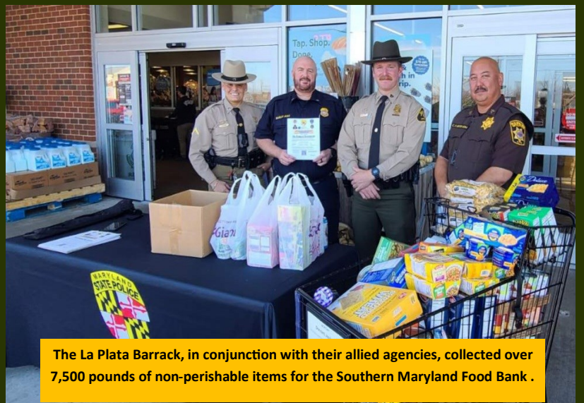
The La Plata Barrack, in conjunction with their allied agencies, collected over 7,500 pounds of non-perishable items for the Southern Maryland Food Bank .

Questions or comments? Email us at msh.media@maryland.gov