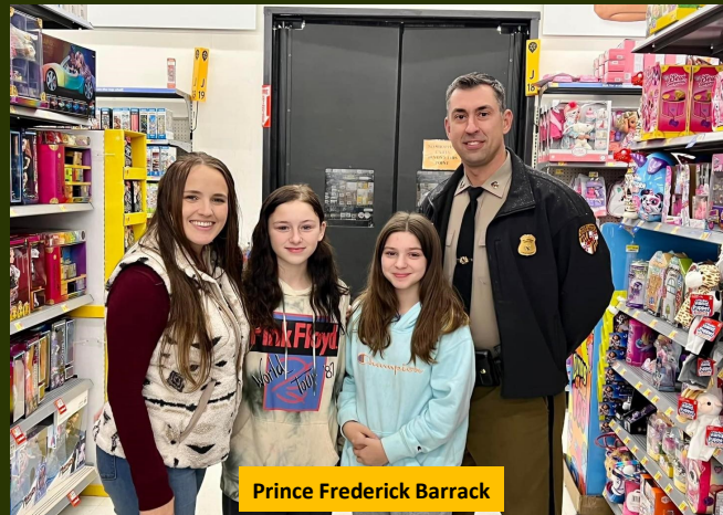
Prince Frederick Barrack