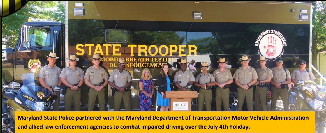
Maryland State Police partnered with the Maryland Department of Transportation Motor Vehicle Administration and allied law enforcement agencies to combat impaired driving over the July 4th holiday.