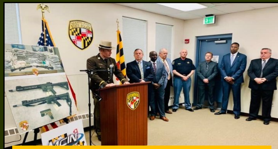
Maryland State Police joined law enforcement agencies from across the region to announce the indictment of nine people associated with an Eastern Shore drug trafficking organization.

As a result of those search warrants, police recovered over 18 kilograms of cocaine, 2.7 kilograms of heroin/fentanyl, 5.9 kilograms of crystal methamphetamine, 170 pounds of marijuana and approximately 34 firearms along with money believed to be connected to the drug operation. The Caroline County Drug Task Force is a multi-agency drug task force, based in Ridgely, Maryland; which functions under the