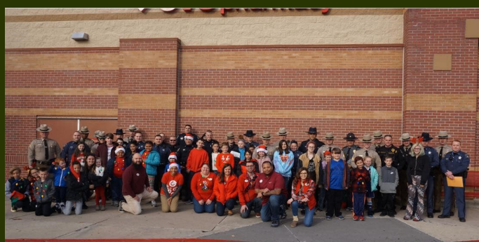
Troopers from the Bel Air Barrack participated in its third annual Shop with a Cop event in Harford County.